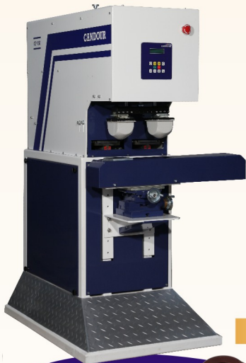
CP 150 D