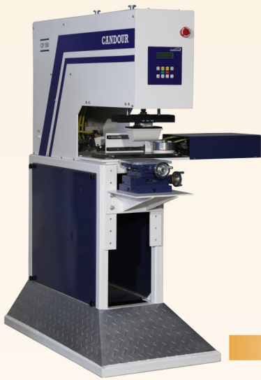
CP 150 H