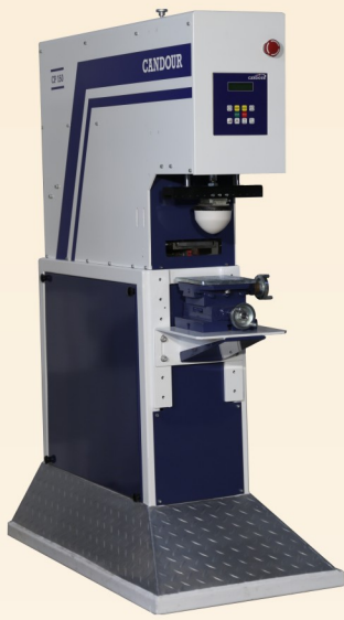
CP 150 S